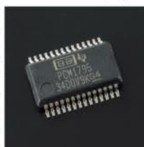
DAC chip PCM1795

For the DAC chip, a Texas Instruments Incorporated 32-bit compatible PCM1795 is used. The USB input is capable of supporting up to 192kHz/32-bit PCM data as well as DSD data (2.82 M, 5.64MHz). The S/PDIF input supports up to 192kHz/24-bit PCM signals. The digital inputs consist of a coaxial line and an optical line plus a USB input to connect to digital outputs such as a CD player or high resolution portable audio player. A selectable 32-bit digital filter offers 2 options for PCM whilst an analog selectable FIR filter offers 2 types of DSD. Low phase noise clock modules with high precision and low jitter are fitted independently for the 44.1k and 48kHz channels respectively. This feature remarkably reduces the jitter for the USB input through asynchronous communication for the S/PDIF by embedding a DAIR high-precision clock.